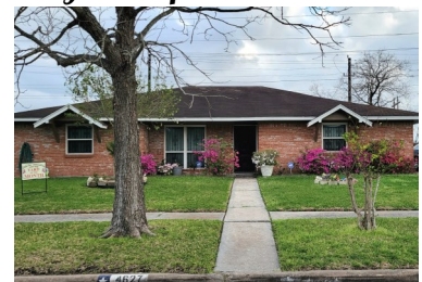
4627 Trail Lake