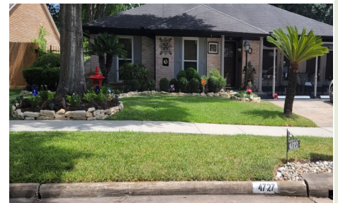
4727 Lotus Street