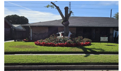
4739 Trail Lake